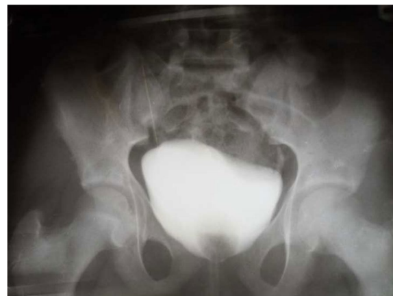
Fig. 2 Micturating cystourethrogram

neck, double-breasted urethroplasty, sphincteroplasty, clitoroplasty, labioplasty, and monsplasty (Fig. 3A–D). The urethral catheter was left in situ for 14 days. She did well post-operatively (Fig. 4), achieved continence, and has remained dry up to the last follow-up visit. She is currently 4 ½ years post-surgery and is fully continent of urine. She is now married and has delivered a 1-year-old female child (per vaginam).