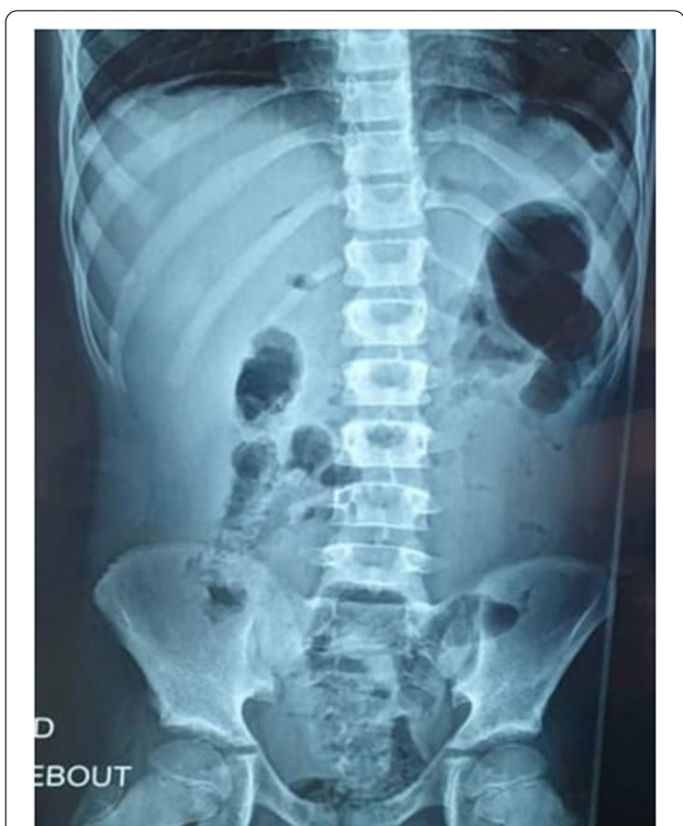
Fig. 1 Plain abdominal X-ray revealing free air under both copulae of the diaphragm

The rate of co-occurrence of the perforation of acute appendicitis and pneumoperitoneum is about 0 to 7% [2]. The rate of pneumoperitoneum following traumatic