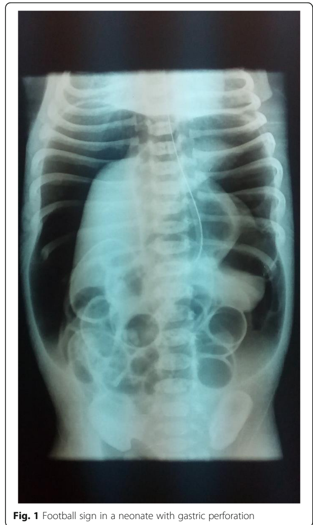
Fig. 1 Football sign in a neonate with gastric perforation

A total of 46 neonates were included. Male gender predominated with M:F being 1.7:1. Most of them were full term (69.6%). Twenty patients were having weight less than 2.5 kg, and 5 had < 2 kg weight. About 60.9% ( n=28 ) were delivered by caesarian section. The history of neonatal asphyxia prior to presentation was found in only 10 (21.7%) patients while none had history of mechanical ventilation, but 11 (23.9%) remained admitted in intensive care unit. Nasogastric tube was attempted in 14 (30.4%) neonates before admission. Three neonates (6.5%) had associated congenital heart disease, two had duodenal atresia, two with respiratory distress, and eight neonates had associated perinatal factors. Feeding was already started in 37 neonates, and 43.5% ( n=20 ) were given formula feed; however, no feeding was started in 9 neonates. Most ( n=38 ) neonates presented within 10 days of life whereas 8 neonates came within 15 days. At presentation, gas under diaphragm was the most common radiologic finding in 25 (54.3%) neonates, out of which 6 patients had typical food ball sign (Fig. 1). The demographic and clinical details are summarized in Table 1.