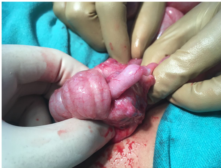
Fig. 1 Patient A with appendiceocecal intussusception