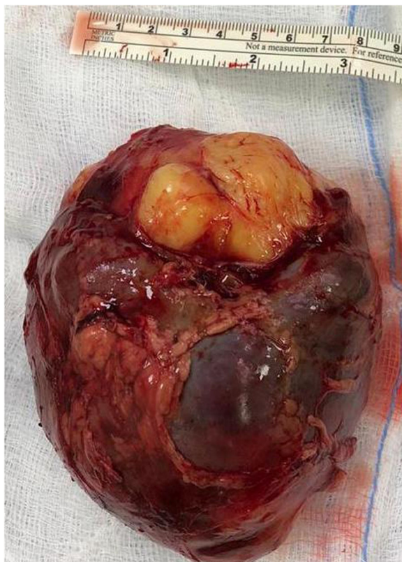
Fig. 3 Gross appearance of the excised tumor showing smooth surface intact capsule and heterogenous consistency

Current advances in antenatal diagnosis enabled cases to be detected as early as 26 weeks gestational age [5]. Our case was discovered at 35 weeks; this was the only study done at the presentation. At birth, unilateral abdominal mass is the unique clinical feature of this tumor found in 73% of cases [6]. It is important to clarify the origin, size, and consistency of the tumor by conducting a careful clinical examination. Moreover, features of