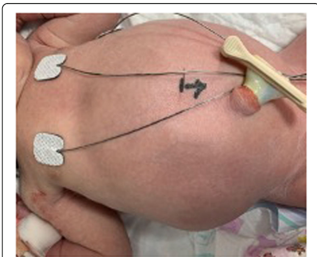
Fig. 1 Clinical exam with right side abdominal mass

A full-term boy with intrauterine growth restriction (IUGR) was delivered via normal vertex delivery (NVD) with a birth weight of 2.3 kg, referred at birth with an abdominal mass. His antenatal scan at 35 weeks showed a cystic abdominal mass. On delivery, the physical examination was unremarkable apart from the huge abdominal mass (Fig. 1). The mass was of cystic consistency and smooth surface mainly at the right side of the abdomen. Systolic blood pressure was initially 98 mmHg and the diastolic was 75 mmHg. This elevated blood pressure was responsive to hydralazine therapy. Aldosterone and renin were significantly elevated at more than 100 and 500 ng/dl, respectively. Serum neuron-specific enolase